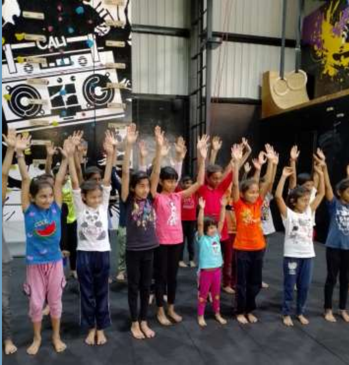
March - Gymnastics workshop for 4 th Std. students at CaliOG, Koramangala.