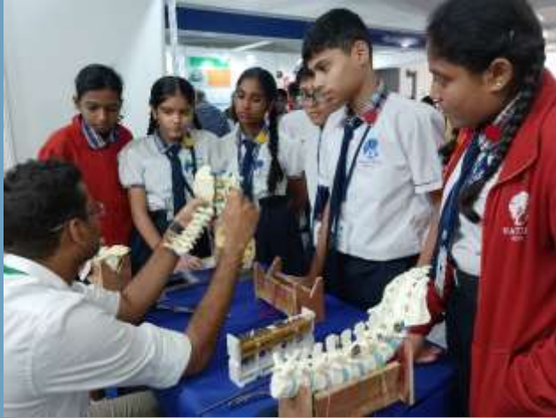
February - Science Open Day – NIMHANS