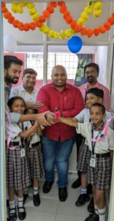
March - Water purifier installed at Jayanagar School by Rotary Club of Bangalore.